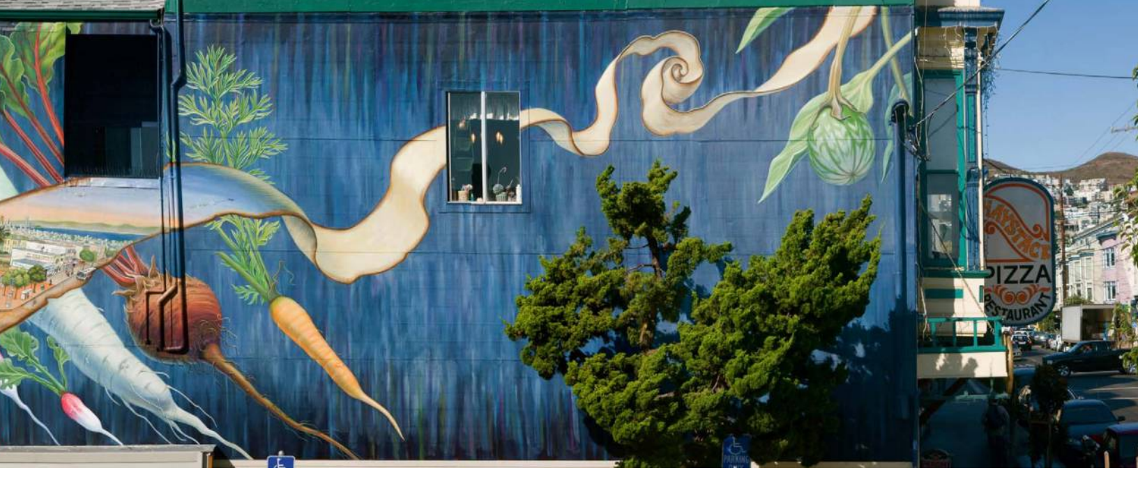
Mural in Noe Valley, San Francisco by Mona Caron.

sustainability. The complexity of these politics assert themselves even though-perhaps especially becausesustainability's adherents and promoters tend to view and present the concept as so common sense and unquestionably good as to be "post-political."<sup>5</sup> This is an alluring proposition-who doesn't want to sustain something, and who doesn't want their ideal future to be easily achieved? Moreover, any argument against sustainability can seem like one for the forces of the apocalypse. Yet, seeking answers to these questions, one sees that in fact sustainability is neither simple nor singular. Rather, multiple sustainabilities are in circulation, and in competition. What's more, these different versions reflect the particular values of the individuals, communities, industries, cities, nations, and so on, that are in position to define the term. Hence, the sustainable future we seek to build depends entirely upon whose sustainability we are talking about.